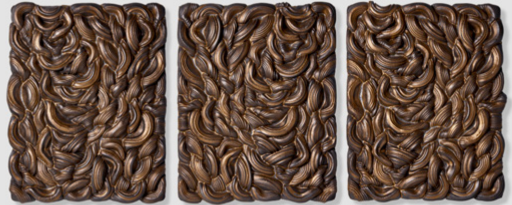
Striped Symmetry Fold IV Steven Edwards Unique | 2024 Parian & porcelain H 52 cm W 22 cm D 22 cm