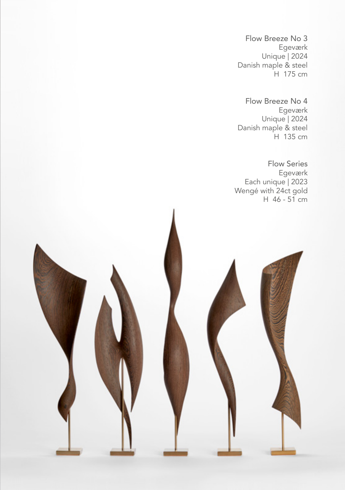
Flow Series Egeværk Each unique | 2023 Wengé with 24ct gold H 46 - 51 cm