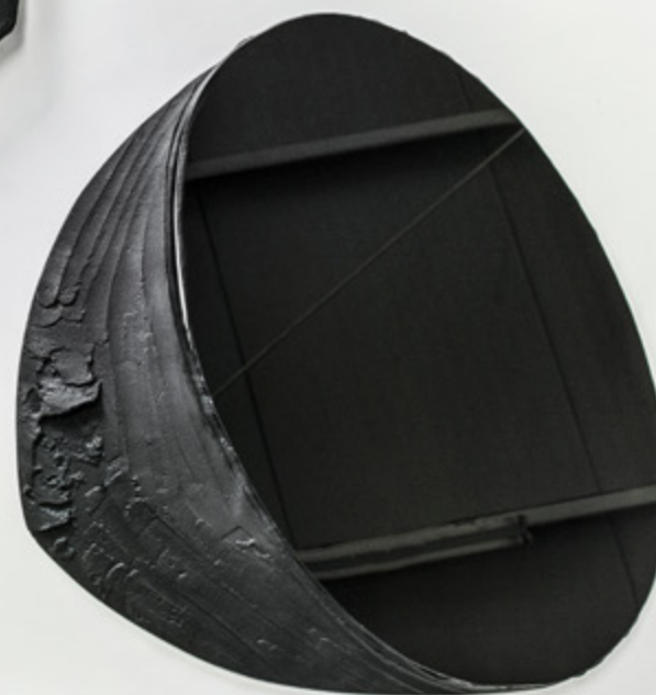
there where I am not - Place (ii) Karen Browning Unique | 2022 Cast glass H 30 cm W 30 cm D 3 cm