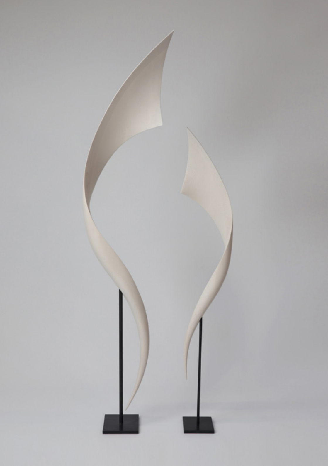
Flow Breeze No 3 Egeværk Unique | 2024 Danish maple & steel H 175 cm