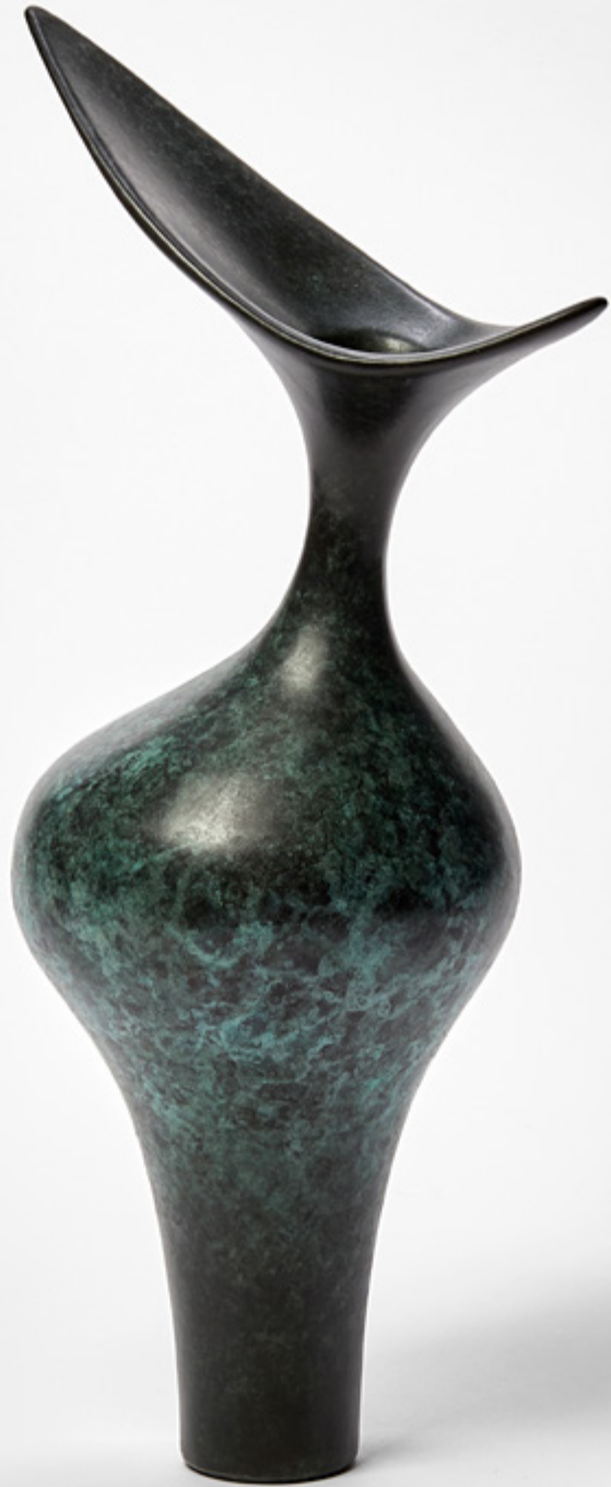
Tall Bird Form Vivienne Foley Edition No 1/3 + 2AP | 2023 Bronze H 38.5 cm W 18 cm D 14 cm