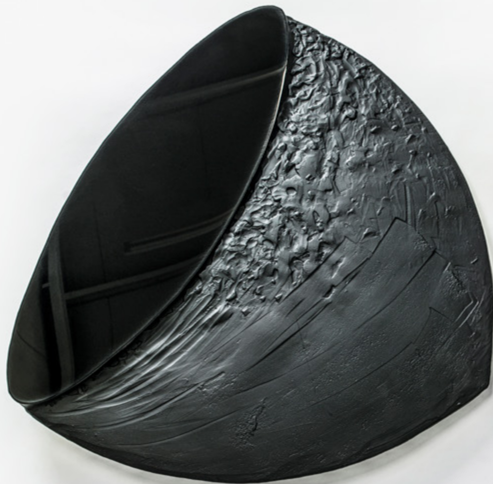
there where I am not - Place (i) Karen Browning Unique | 2022 Cast glass H 65 cm W 65 cm D 4 cm